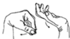
Wrist Range Of Motion