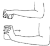
Wrist Extension Exercise