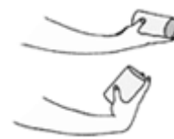
Wrist Flexion Exercise