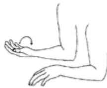
Pronation And Supination Of The Forearm